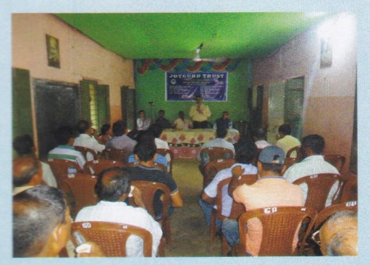
Secretary of DMKK delivering speech in the pogramme of Joy Guru Trust FPO