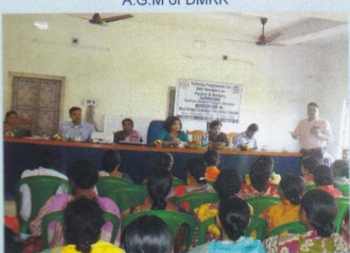
Officials of WBSCLvisited training centre at Andharia G.P under Binpur-I Block