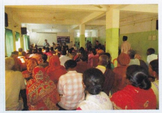
Awarness pogramme and quilt distribution for T.B patients