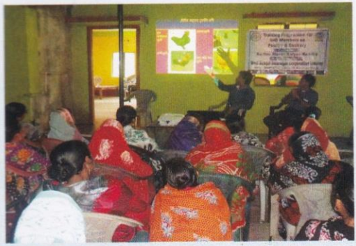
Training pogramme on Poultry and Duckery in collaboration with WBSCL