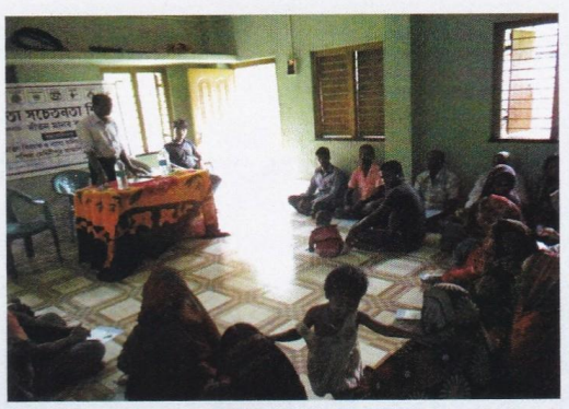
Consumer awarness pogramme at community level