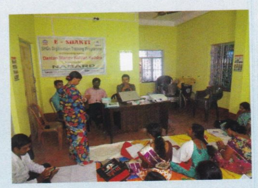
Mobile handset training to the animators of E-Shakti