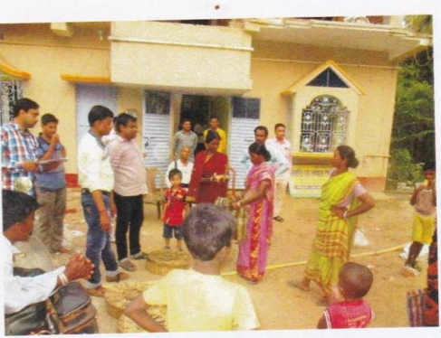
Chicks distribution among neddy Tribal women