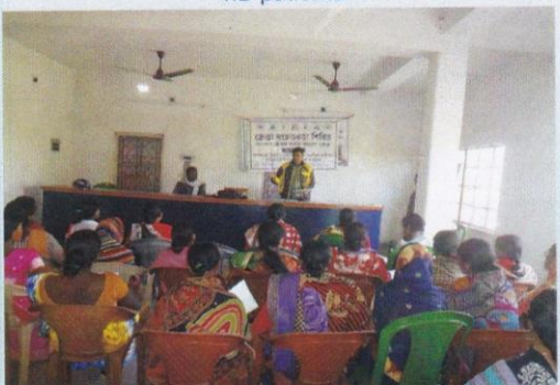
Consumer awarness programme at G.P level