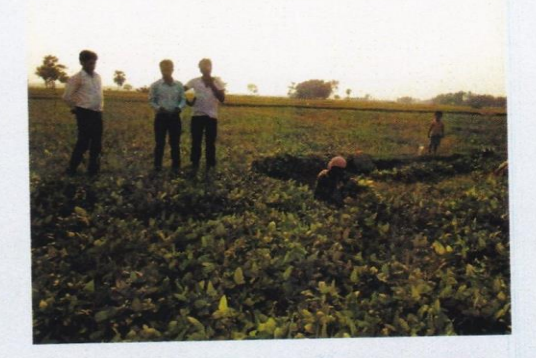
'Kalai' Cultivation in lieu of Paddy by one FPO