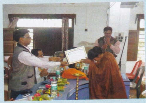
Certificate distribution by BDO Mohanpur to a trainee under Swawlamban