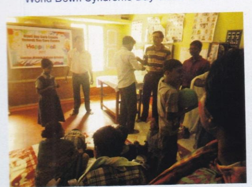
Holy celebration in DMKK office