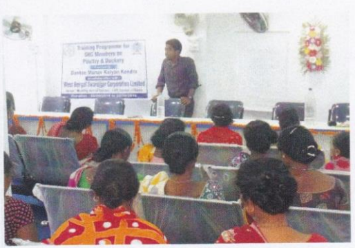
Training pogramme on Poultry & Duckery at Dantan-I G.P