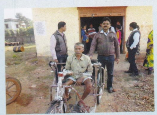
Tri - cycle distribution by BMOH Mohanpur under a camp organized by DMKK