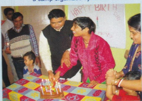
Birth Day celebration of a beneficiary under Niyoti Day Care Centre