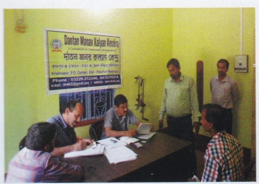
Assesment camp by VRC Kolkata