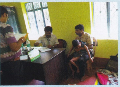
Health Check - up camp for the beneficiaries of Day Care Centre