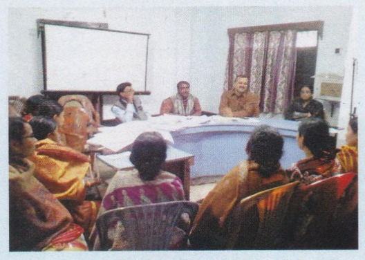
Discussion with the animators under E-Shakti at Mohanpur Block