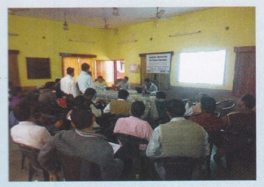
Residential training of the CEOs of FPOs