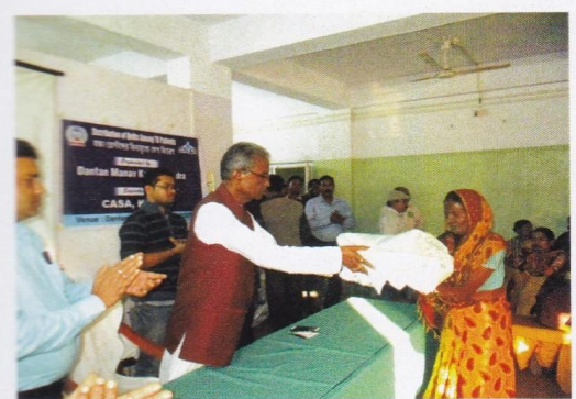
M.L.A - Dantan disrtributing quilt to one T.B patient